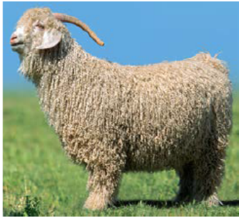
Angora goat: $2.70