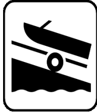
ramp, wheel + axle