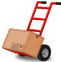
Lever, wheel + axle