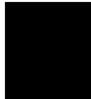
wheel + axle